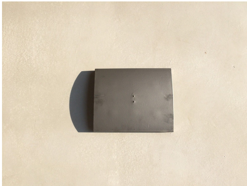
Untitled (production footage image) 2017 © Matej Andraž Vogrinčič courtesy KANA KAWANISHI GALLERY