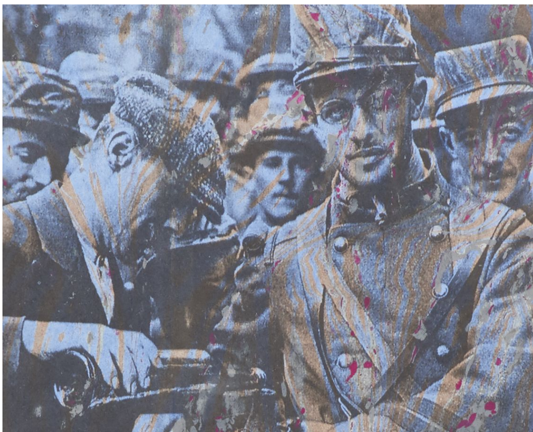
Formless (detail) 2016 | acrylic on newspaper | 54.0 × 79.5cm

We hope that his new expressions based on the own intense experiences and researches would become inspiring experience for all viewers.